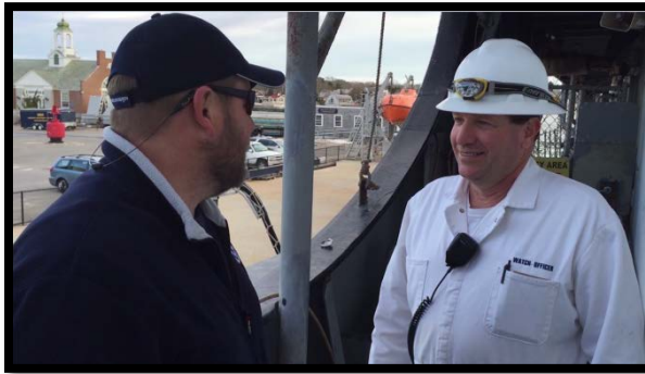
Masters & Mates