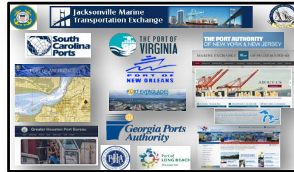
Port Exchange Committees